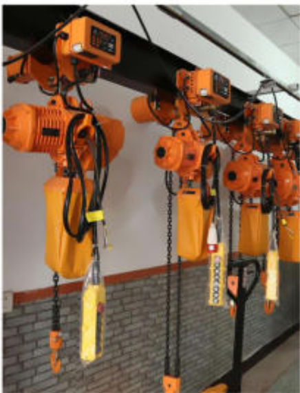
Electric trolley type